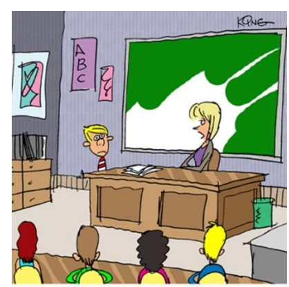
"Your handwriting is atrocious, not encrypted."

20. What does Encryption software do to data?